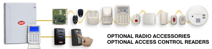
OPTIONAL RADIO ACCESSORIES OPTIONAL ACCESS CONTROL READERS